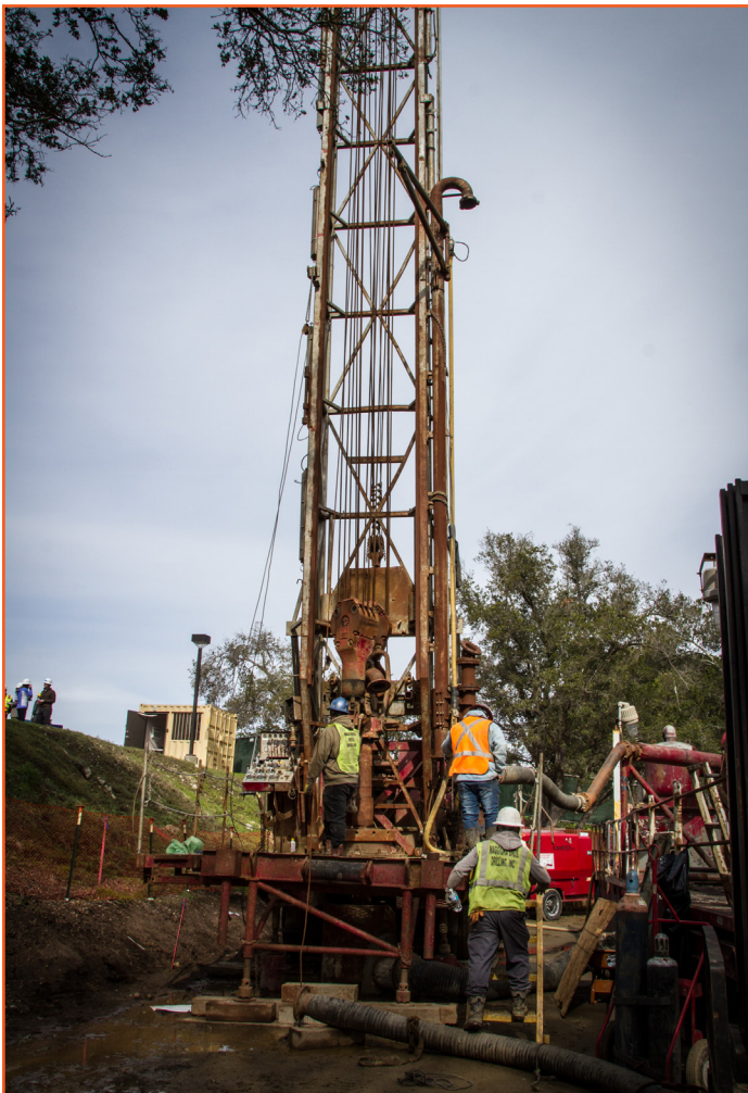
Maggiora Brothers Inc. employees hard at work prepping the drill rig.

Do you want to see time lapse videos of the TLC Pilot Well Project? Visit https://vimeo.com/sqcwv