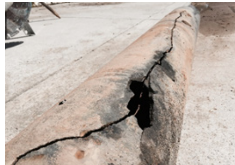
Old cast iron pipe.

The project is estimated to cost $4M and scheduled to begin in Nov 2018. Construction is anticipated to last 15-18 months.