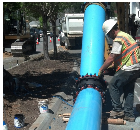
Phase I of Soquel Drive Main Replacement (from Main St in Soquel to Cabrillo College).