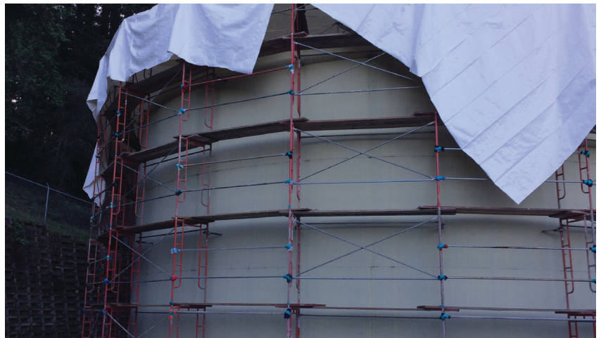
The Cornwell Tank receiving new paint and structural upgrades.