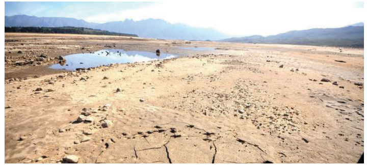
Theewaterskloof Dam at a critically low water level.

This entire scenario sounds like something out of a dystopian novel. Could this happen here in California and especially here in Santa Cruz County? With climate change it very well could. A study published in Nature Communications provides compelling evidence that rain over California will diminish by as much as 15% in the next 20–30 years and more frequent droughts will likely occur. With more frequent droughts, California will also be facing more wild fires as the state gets drier and drier.