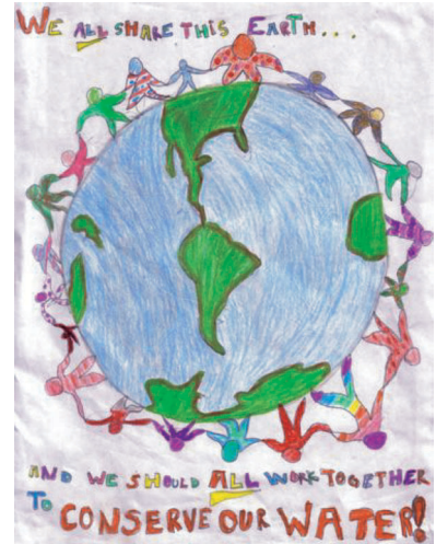
Poster contest winner Jenna Forster's first place poster "Share."